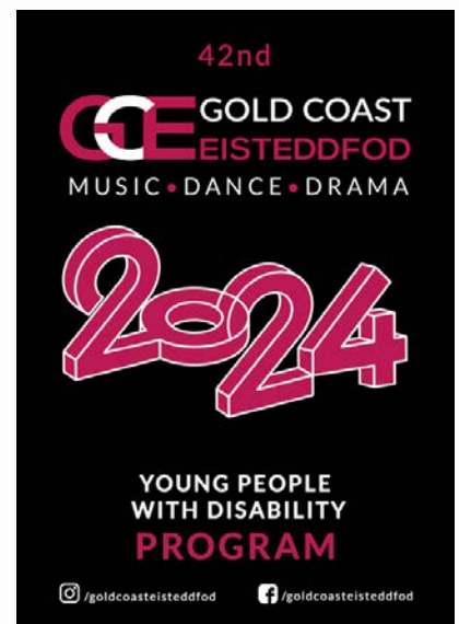
Young People with Disability