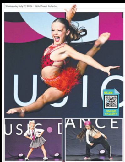
Competitors strut their stuff during the Dance Sales on Day 1 of the Gold Coast Eisteddfod.

WATCH THE NEWS Channel 7 News Story 1 Channel 7 News Story 2